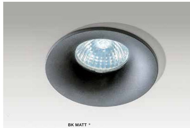
BK MATT *