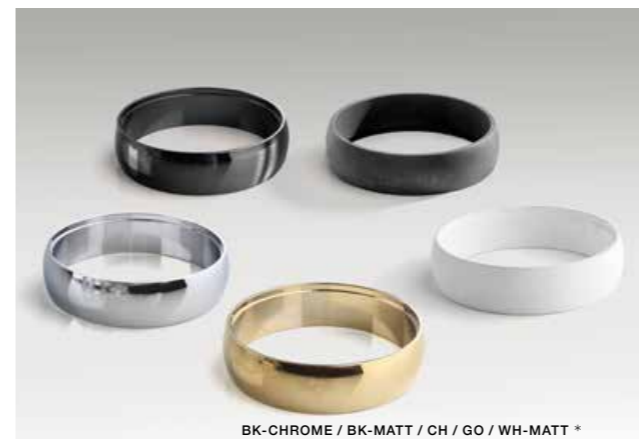
BK-CHROME / BK-MATT / CH / GO / WH-MATT *